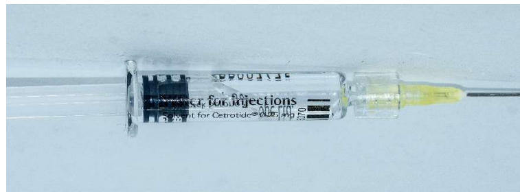
Picture 3. Plunger pulled out completely, sterility is lost