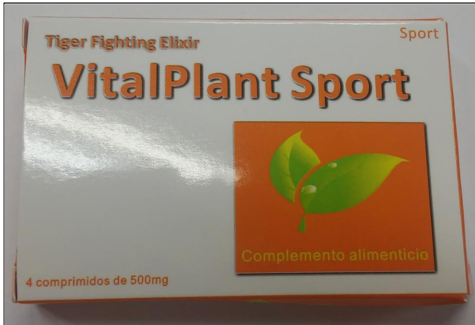
VITALPLANT SPORT capsules (1)